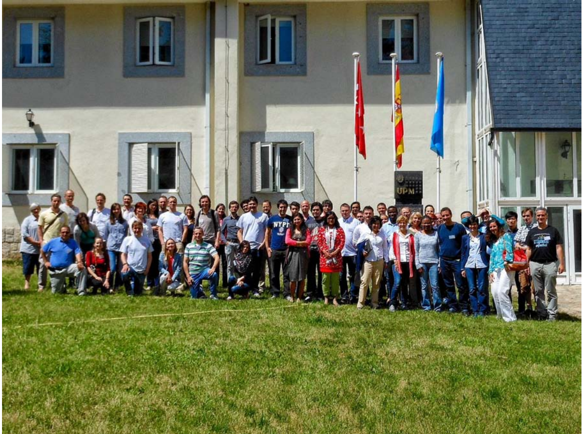
Figure 5: SD-LLOD'15 participants.