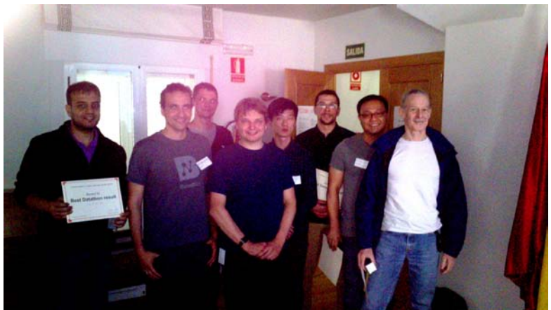
Figure 6: Winners of the "best datathon result" award with the datathon organizers after receiving the prize.

After a voting among the participants, the GuanXi Networks project, by Group 1, was selected as the best datathon project and therefore declared as winner of the " best datathon result " award (600€, evenly split). Figure 6 shows a picture of the group members after receiving the prize.