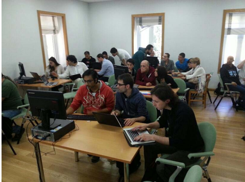
Figure 2: Work during a practical session.