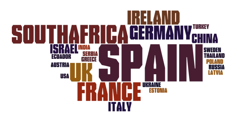
Figure 3: Word cloud with the participant countries.

Figure 3 shows a world cloud with the different represented countries along with their relative importance (font size). A world map with the location of the different represented cities can be found in Figure 4 below.